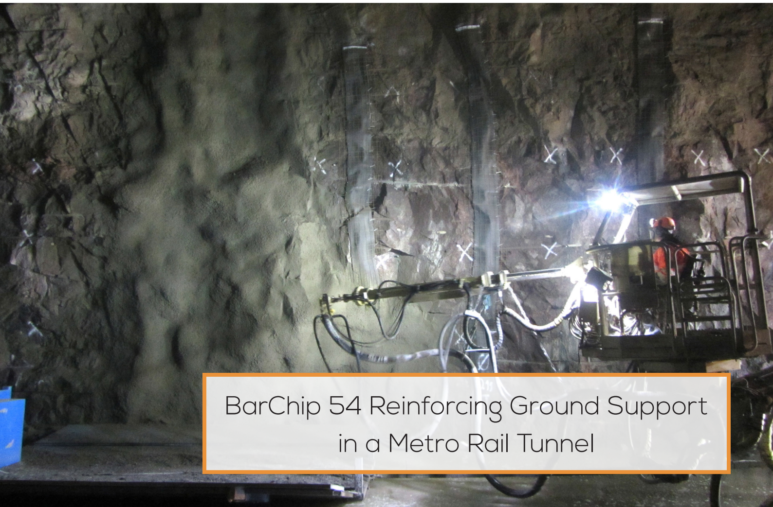
BarChip 54 Reinforcing Ground Support in a Metro Rail Tunnel