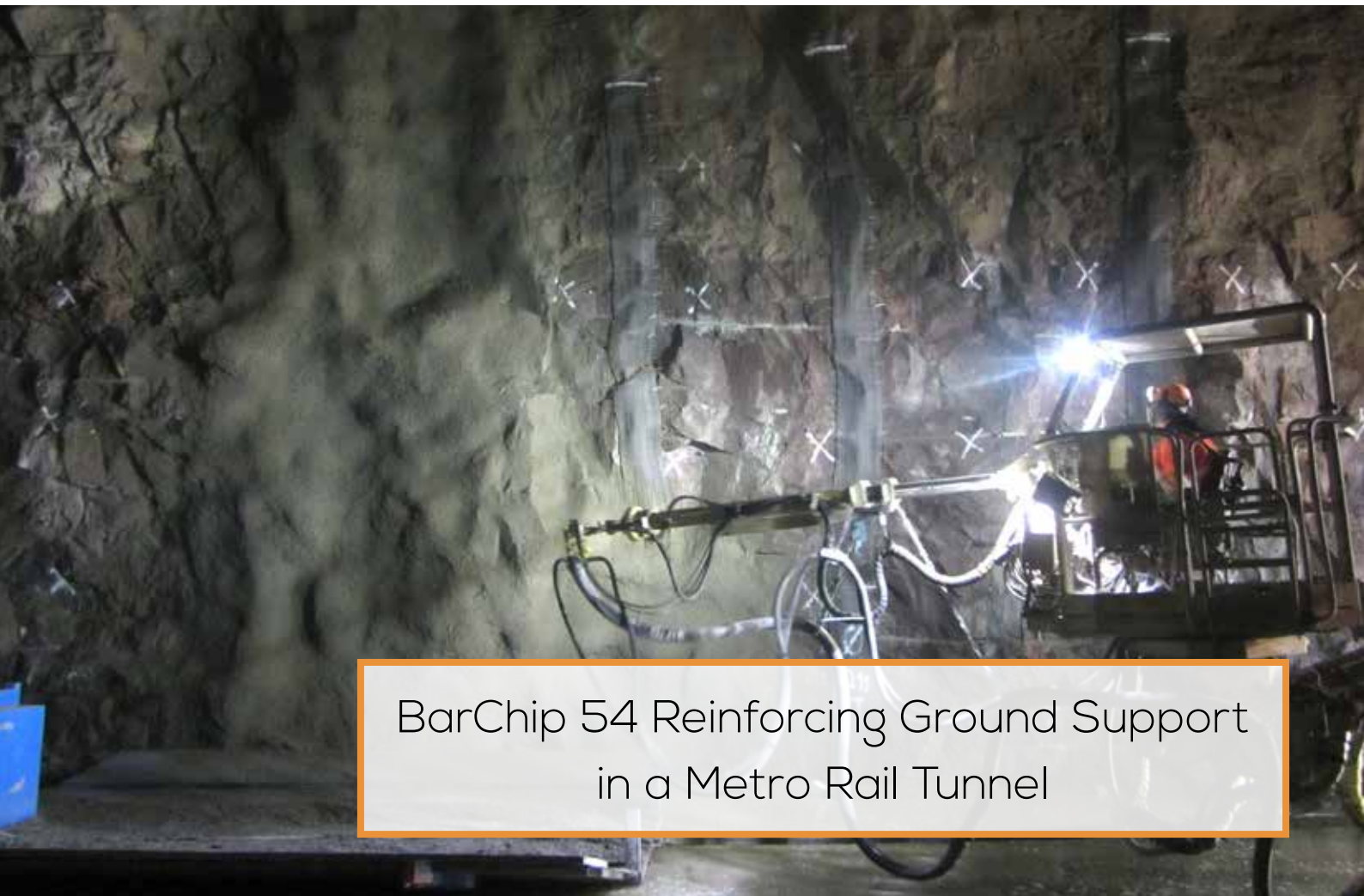
BarChip 54 Reinforcing Ground Support in a Metro Rail Tunnel