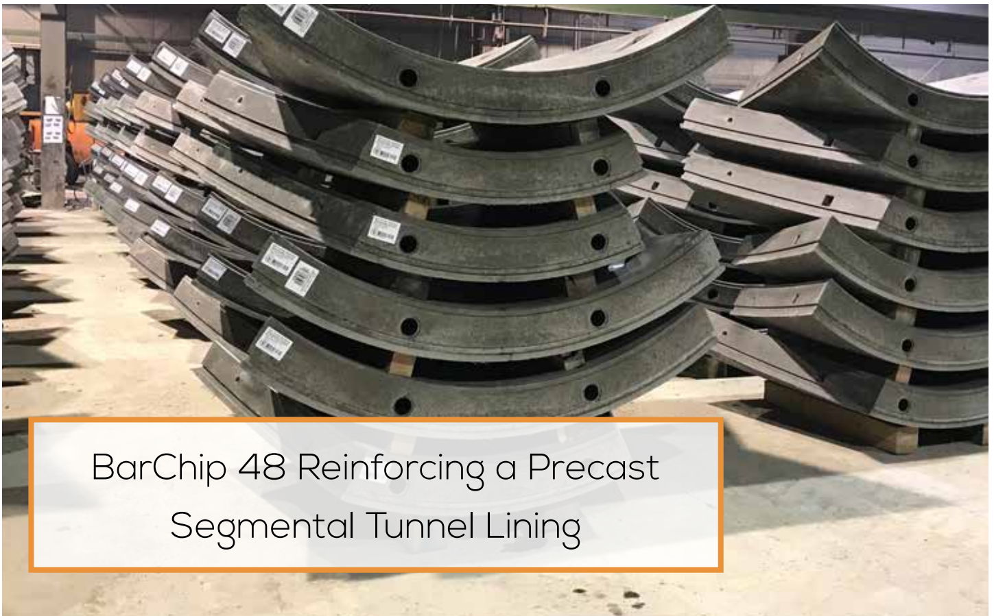
BarChip 48 Reinforcing a Precast Segmental Tunnel Lining

X = included in the EPD; MND = Module not declared (such a declaration shall not be regarded as an indicator result of zero)